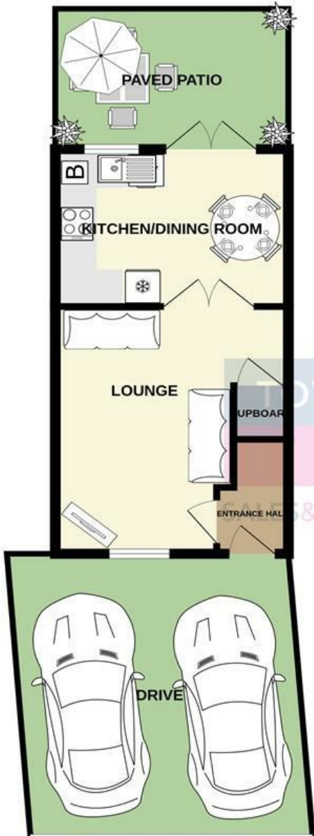
GROUND FLOOR 302 sq.ft. (28.1 sq.m.) approx.